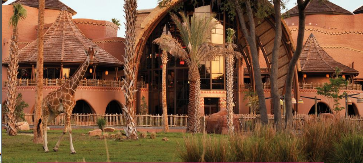
Animal Kingdom Villa- Kidani Village